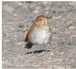
Swainson's Thrush is reported nearly every winter in Northern California, but such reports are rarely verifiable. This Swainson's Thrush at Bolinas, Marin County 27 December 2014 was one of the few reported ever to be adequately documented.