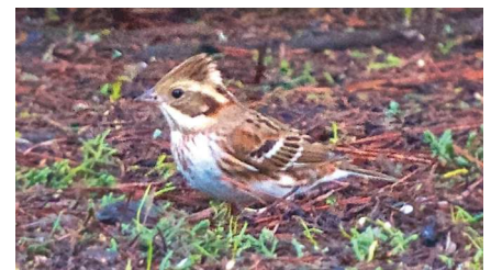
The Northern California region has hosted four of the state's five Rustic Buntings. This bird was at Golden Gate Park from 6 (here 13) December 2014 through the end of the winter period, affording many birders excellent studies.

Eight Summer Tanagers were all in coastal counties, a total more than twice our long-term