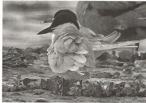
Northern California had two previous reports of Gull-billed Tern from the 1960s but no photographically documented records until spring 2009. This bird, initially found in Palo Alto, Santa Clara County on 3 May, reappeared in Redwood City, San Mateo County, where this photograph was taken on the second day of its 17-19 May stay.