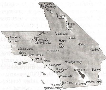
Guy McCaskie Kimball L. Garrett

The season was highlighted by California's first spring Great Crested Flycatcher and a late Snow Bunting exceptionally far south in San Diego County. There was an impressive number and variety of vagrant passerines from the east in eastern Kern County and elsewhere; these included a greater-than-average showing of "southeastern" warblers and vireos, in a minor echo of