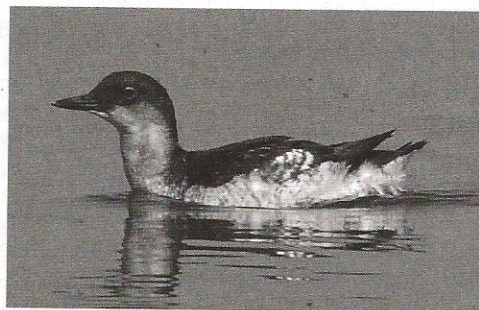
The few Pigeon Guillemots nesting inside San Francisco Bay rarely stray far from the Golden Gate. This bird, present 28 July 2013 and later (here 3 August) on a former salt pond in Alviso, was unusually far inside the Bay and provided Santa Clara County with its first record.