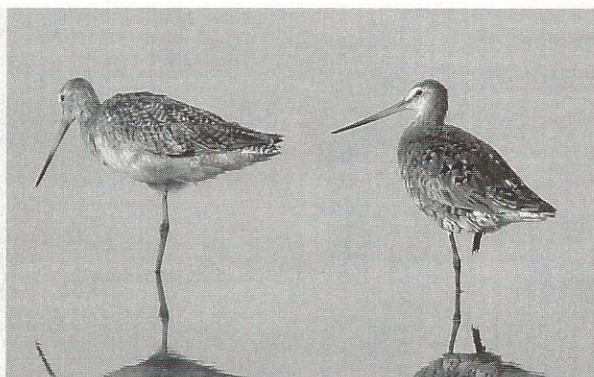
This Hudsonian Godwit (the right bird) south of Corcoran 10 June 2009 provided the first record for Kings County, California and only the second June record for the state.