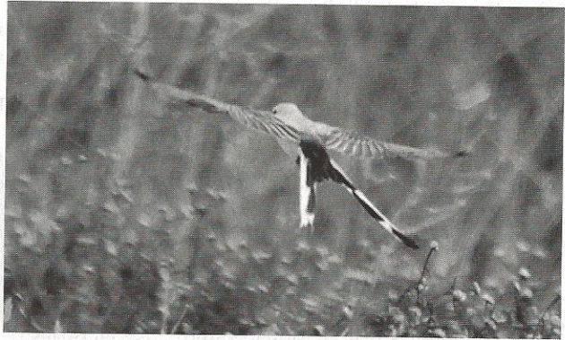
This Scissor-tailed Flycatcher at Mountain View, California 6 June 2009 established the second record for Santa Clara County.