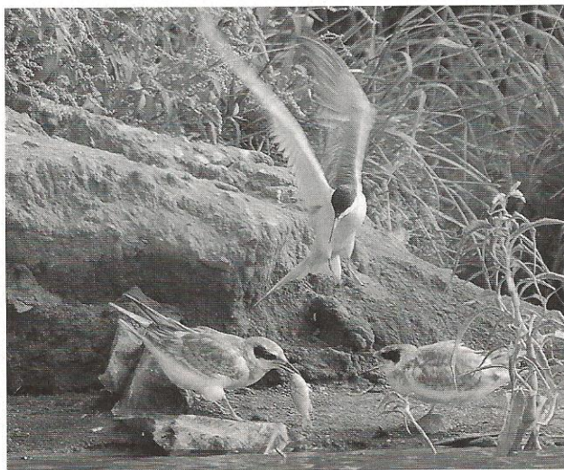
Making the first breeding record for Fresno County, California, these Forster's Terns were among a small colony at a groundwater recharge facility in central Fresno 16 July 2009.