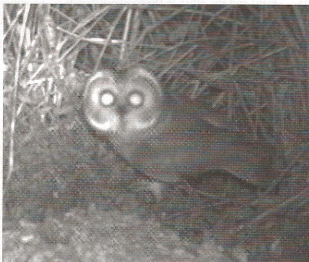
Detected by remote infrared camera, this Northern Saw-whet Owl provided a rare Central Valley record at the San Joaquin River National Wildlife Refuge in Stanislaus County, California 21-22 (here 22) February 2013.