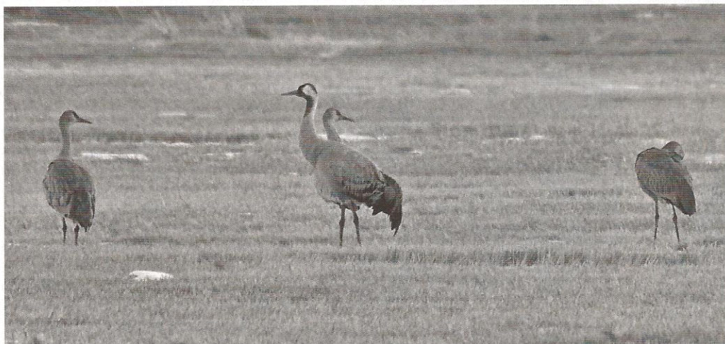
This Common Crane arrived with three Sandhill Cranes at Modoc National Wildlife Refuge, Modoc County, California on 27 December 2012, weeks after all the other cranes had left the refuge. It apparently stayed for only a half hour (before heading to Nevada?), but fortunately it was photographed while it touched down.