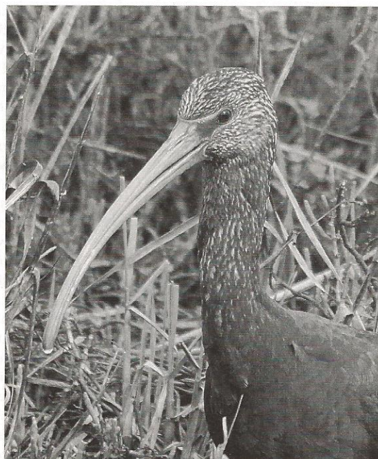
Winter records of White-faced Ibis are on the increase along the central California coast. Following last winter's record strong showing in Santa Cruz County, Santa Clara County logged its first winter records ever this season, with at least four remaining through late January 2010 and at least three through the reporting period. All appeared to be first-winter birds, wandering along south San Francisco Bay from Palo Alto (where this bird was photographed 6 March 2010) to Sunnyvale.