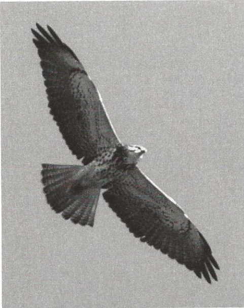
A small number of mostly dark-morph Swainson's Hawks winters in the Sacramento River delta region, but winter records away from there are still exceptional in Northern California. Thus completely unexpected was this light-morph juvenile in Coyote Valley 13 January 2010, the first ever found in Santa Clara County in that month.