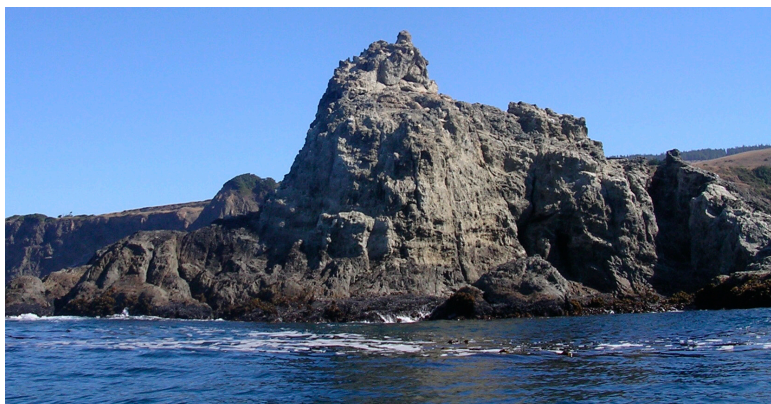
Figure 2. Overview of Franklin Smith Rock (southwest-facing side), 27 August 2012.