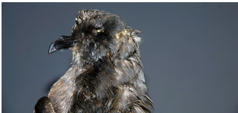
Figure 4. Head of a mummified adult Ashy Storm-Petrel obtained at Franklin Smith Rock, 12 November 2014.