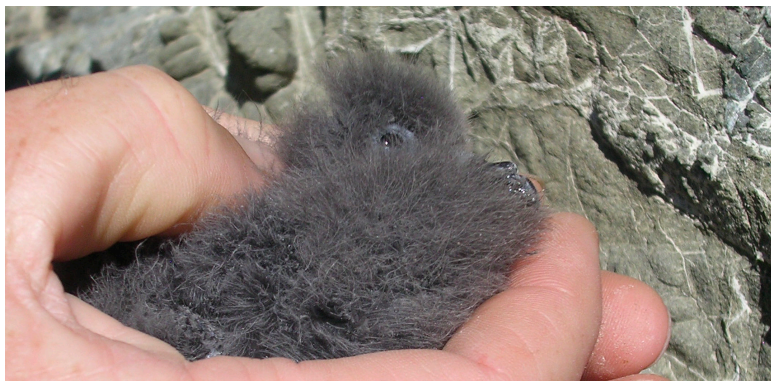
Figure 3. Large downy unidentified storm-petrel chick found in a crevice on Franklin Smith Rock, 27 August 2012.