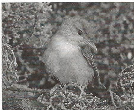
This Yellow-green Vireo made the eighth record for Southeast Farallon Island, San Francisco County, California 29-30 (here 29) September 2013.

13 Sep (captured and banded, RDIG), and at Arana Gulch, Santa Cruz 16 Sep (imm., ph. SGe). Also in Santa Cruz, the county's fourth Yellow-green Vireo visited Bethany Curve Park 27 Sep (ph. NLV). Another on FI. 29-30 Sep (ph. CR et al.) was the island's eighth. A Western Scrub-Jay of the bright and brash coastal subspecies made a rare appearance 14 Oct (ph. KNN) at Dechambeau Creek, Mono, where only the dull and subdued interior subspecies is expected. The first Yellow-billed Magpie in Santa Cruz since 2008 was at Soda Lake 27 Oct (ph. AMR). A total of 18 Purple Martins, most or all imm., at Antonelli Pond 13 Sep (SGe) represented a remarkably high count for Santa Cruz. An estimated 100,000 Tree Swallows were found roosting near Kasson Rd. and Durham Ferry Rd. in Tracy, San Joaquin 19-25 Oct (JRow, Elinora Bjur, m.ob.). These birds possibly represent breeders from Alaska and nw. Canada, as breeders s. of there tend to depart in Jul and Aug (Bruce Couzens). Aside from the birds thought to have been present at two historic breeding colonies along the Sacramento River, 2500 Bank Swallows along the Pit River near Likely, Modoc 10 Aug (SCR) represents the largest concentration of this species ever documented in the state. A Barn Swallow over FI. 29 Nov (JTz, Suzie Winquist) was the latest ever recorded there.