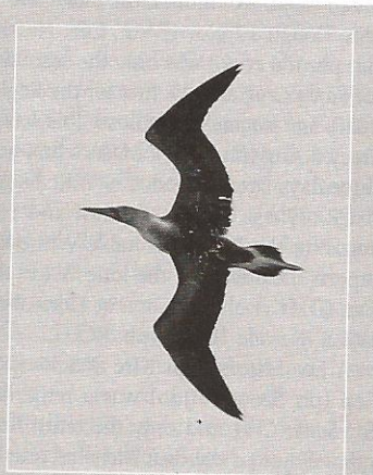
Among the Blue-footed Boobies invading the California coast was this individual at Southeast Farallon Island 25 September 2013. All five species of sulids known from North America have now been recorded on the Farallones.

The highest number seen together was 3 at Monterey Harbor, Monterey 18 Sep (Cooper Scollan). One on a Monterey Bay whalewatching trip was the only one seen from a boat offshore, but at least 4 made it to FI. 18 Sep–8 Oct (Point Blue). Although a few ads. were reported, all well-documented birds were apparently hatch-year birds. The reason for this invasion is unclear, but given the predominance of hatch-year birds, it is likely that high reproductive success followed by a decline in food resources was responsible (JM). Birders scoured S.F. Bay and inland reservoirs looking for individuals away from the coast, but unlike the case in s. California, all birds after the Mono individual were coastal. The Region had only four prior records, with single records from Monterey , S.F., Calaveras , and Del Norte .