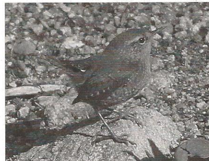
Two Winter Wrens were documented in Northern California in fall 2013. This one on Southeast Farallon Island 31 October (here) through 4 November furnished the second record for the island.

Three American Tree Sparrows included one at Giacomini Wetlands, Marin 2-12 Nov (DS, ph. DJM, m.ob.) and 2 on FI. 5-8 Nov (Xeronimo Casteñeda, ph. JTz et al.) and 11-12 Nov (Point Blue). Notable among our 52 Clay-colored Sparrows was a bird in Chalfant Valley, Mono 2 Nov (ph. ADeM), a county with relatively few records and possibly no prior records away from the vagrant hotspot of Oasis ( fide KNN). A Black-chinned Sparrow banded at Palomarin, Marin 26 Sep (Mark Dettling) provided our only report. Black-throated Sparrows were likewise represented by a single report, Mendocino's fourth at Little River Airport 7