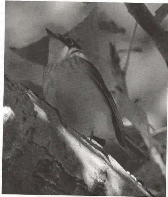
Santa Clara County, California's second Canada Warbler was well documented during its short visit to Sunnyvale Baylands Park 19 September 2009.