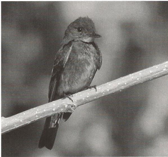
Very late for any location in the United States was this Western Wood-Pewee in the Panoche Valley, San Benito County, California 26 November 2009.