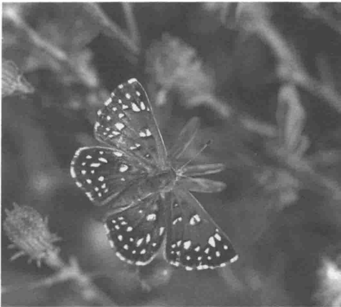
Female Lange's Metalmark on flowers of Senecio douglasii .

By 1931, five huge sand pits, each with a railroad spur, were in operation, for the developing San Francisco Bay area. During post World War II years, massive industrial developments replaced the eastern half of the dunes, and in the 1950s sand mining moved to the western sector. A Kaiser Gypsum plant