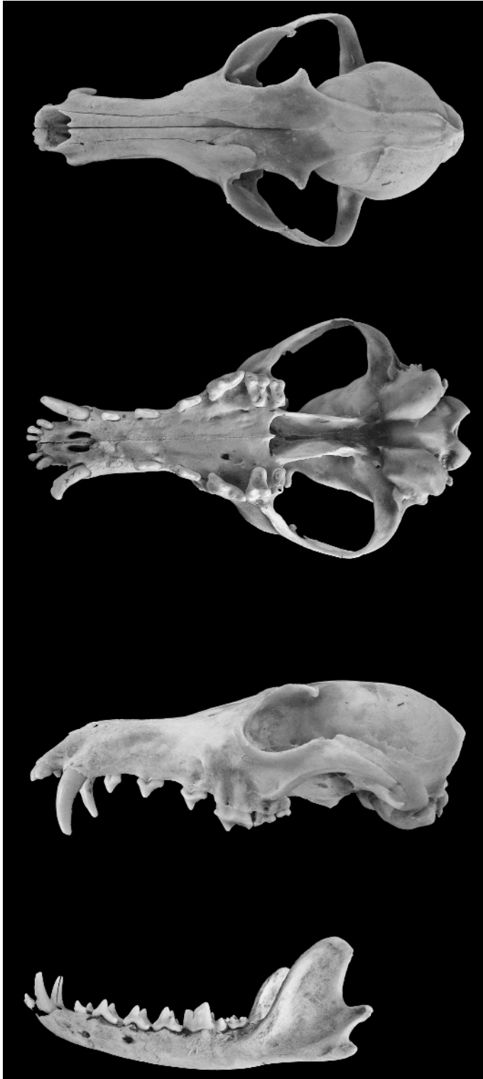
Fig. 2. —Dorsal, ventral, and lateral views of cranium and lateral view of mandible of an adult female Vulpes ferrilata , age unknown. Maximum length of skull = 149 mm. Collected on 3 September 2003. Specimen location: School of Life Science, East China Normal University.