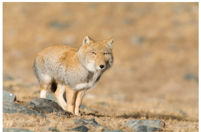
Fig. 1. —An adult Vulpes ferrilata from Qinghai Province, China, about 130 km southwest of Golmud.

References to V. ferrilatus in the literature (e.g., Nie and Liu 2005; Schaller and Ginsberg 2004a; Xu and Gao 1986) reflect Hodgson’s (1842) original spelling that was subsequently corrected for gender (see the synonymy). Przewalski (1883:216) proposed the name Canis ekloni (= Vulpes ekloni ) for a fox that he found in the northern Tibet. Various