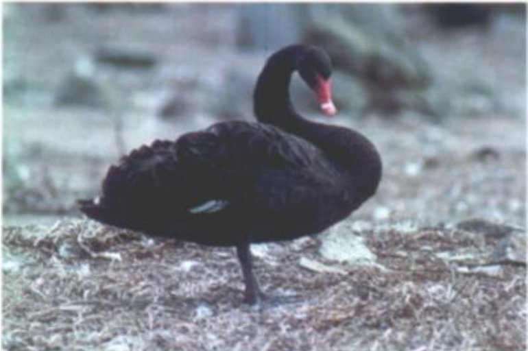
Figure 6. Black Swan, Southeast Farallon Island, 21 September 1991. This individual, presumably an escapee from captivity, was very tame, accepting hand-offered food. It died on the island on 25 September.