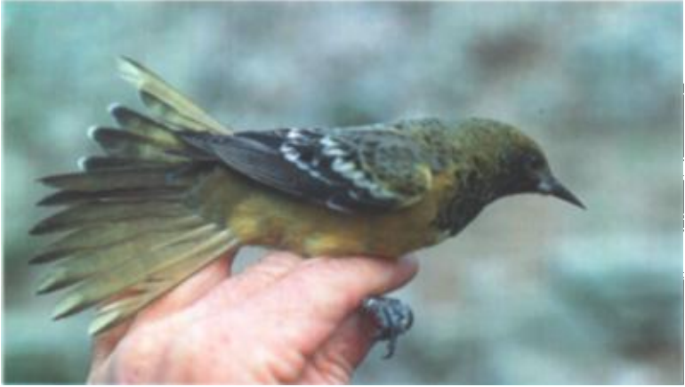
Figure 5. Scott's Oriole, Southeast Farallon Island, 10 November 1993. Two Scott's Orioles arrived on Southeast Farallon in 1993, representing the species' second and third island records.