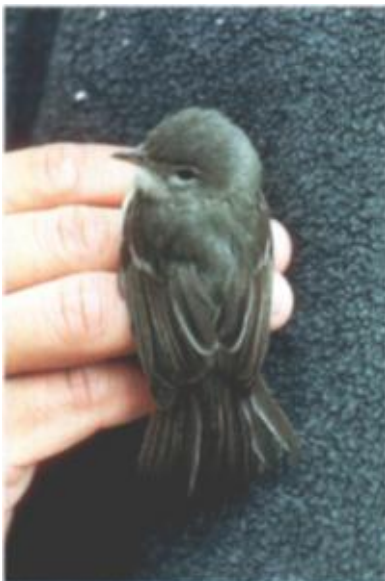
Figure 3. Bell's Vireo, Southeast Farallon Island, 18 September 1993. Two individuals of this species arrived within three days in 1992 and represent the only records of it for the island. This one appears too green to have been the California subspecies, the Least Bell's Vireo, Vireo bellii pusillus .