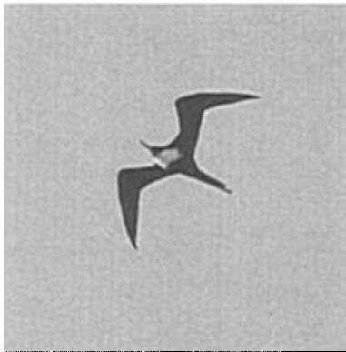
Figure 2. Adult female Great Frigatebird, Southeast Farallon Island, 14 March 1992. This was the first Great Frigatebird accepted for California and still one of only two.

Red-breasted Merganser —The arrival pattern of this species is perhaps more accurately represented by a single over-winter peak (mean arrival 31 December \pm 46 days).