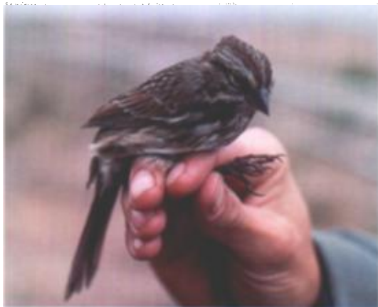
Figure 4. Song Sparrow, Southeast Farallon Island, 15 October 1995. This individual was identified by measurements and plumage as the subspecies Melospiza melodia kenaiensis , breeding in south-central Alaska. There are no published records of this subspecies as far south as California.