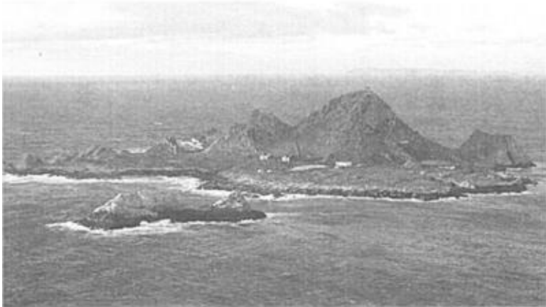
Figure 1. Southeast Farallon Island as viewed from the south. The Point Reyes Peninsula is visible in the background, 29 km to the north.

The bird-monitoring program on Southeast Farallon Island (Figure 1) has been described by DeSante and Ainley (1980), DeSante (1983), and Pyle and Henderson (1991). Each day PRBO personnel census all migrants. Most landbirds congregate at four or five vegetated or prominent areas on the island, facilitating their detection, and we estimate a detection rate of over 95% for birds present on a given day. The environmental conditions and censusing procedures varied little over the 32-year period of data collection. The three Monterey Cypress ( Cupressus macrocarpa ) saplings planted in 1982 (see Pyle and Henderson 1991) have grown in height since 1991, but we assume that this growth has little or no effect on landbird